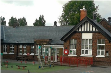
3 Irlam Primary School, Irlam