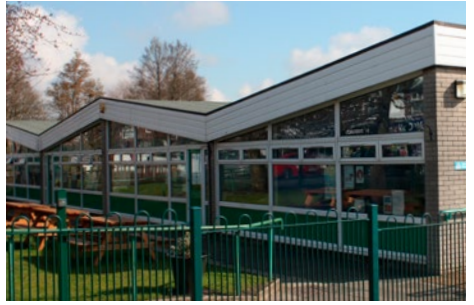
2 Fiddlers Lane Primary School, Irlam