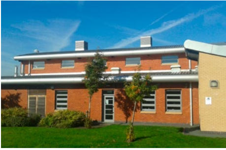
1 Primrose Hill Primary School, Salford